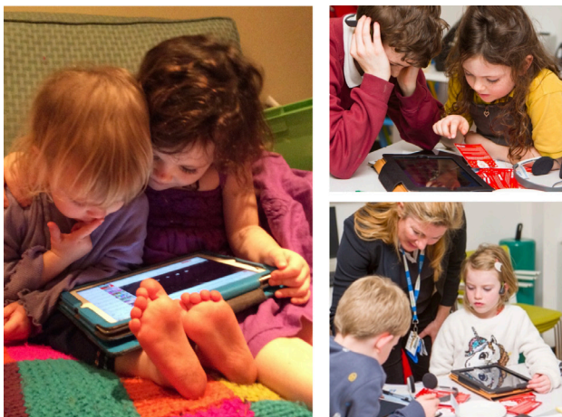
Figure 1 Children using digital health solutions.

artificial intelligence, to enhance diagnostic and safe clinical practice. The emergent integrated care systems recognise the importance of such systems and the need for digital literacy in the workforce to enable the rapid adoption of validated digital tools.