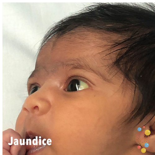
Figure 1 A child with jaundice.

cyanosis ( https://dftbskindeep.com/all-diagnoses/central-cyanosis ) is a key clinical sign in a number of paediatric disorders and is classically described as a blue-purple hue. However, in children with darker skin tones, it may appear as grey or white and at present there are no studies examining how this may affect patient outcomes. 12