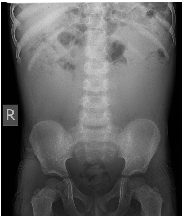
Figure 1 Plain abdominal radiograph.

He was admitted for investigations which included an abdominal radiograph (figure 1) and an ultrasound scan (USS) (figure 2) as well as normal liver function tests, a negative screen for viral hepatitis B and C and a negative Mantoux test. Following review of the imaging and discussion with the surgical team, he underwent MRI of his abdomen (figure 3).