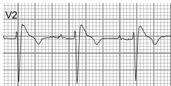
Figure 3 ECG showing characteristic appearance of ST segment in Brugada syndrome.

Assessment begins with an accurate history to confirm syncope, to identify a possible causal mechanism (cardiac, reflex, orthostatic—see box 1 for further characteristics) and to ascertain any relevant background information, including family history. Assessment should