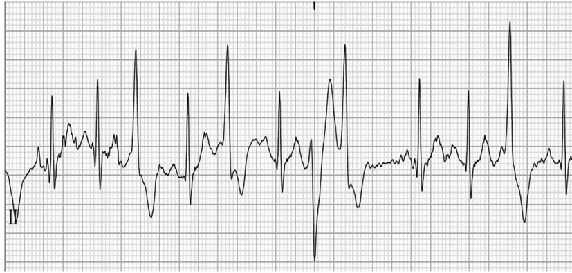
Figure 4 ECG showing appearances of polymorphic ventricular complexes on exercise testing in a patient who is \beta -blocked and known to have catecholaminergic polymorphic ventricular tachycardia.

continue with physical examination. For completeness, BP can be recorded at this time. A 12-lead ECG should be performed as the initial baseline investigation in syncope. On the basis of these initial actions, further investigations or onward referral can be considered.